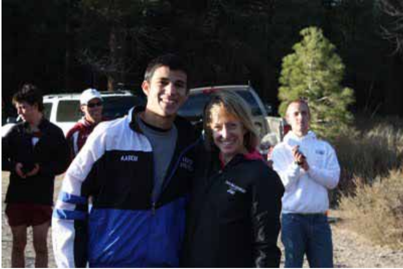
Posted by DCHS XC at 9:47 PM 0 comments